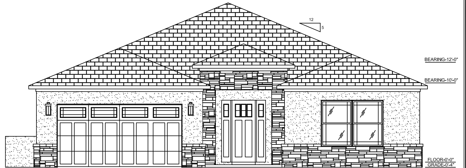
FRONT ELEVATION "C"